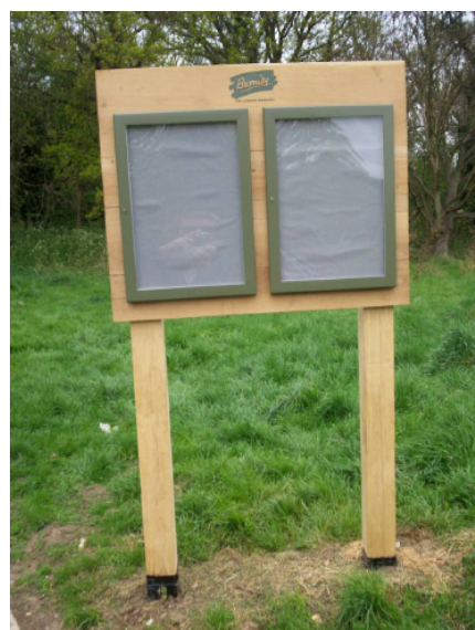
Park Information Board fitted with Postsaver